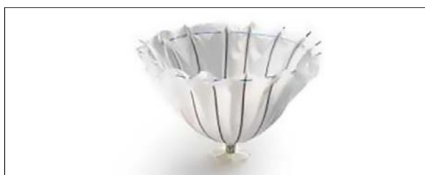
FIGURE 1: PARACHUTE®

The selection of the studies was performed based on the initial analysis of the title and abstract, followed by evaluation of the full text by two independent evaluators, with resolution of the disagreements in both stages by consensus. Full-text studies published in languages other than English, Spanish and Portuguese were excluded but registered for the identification of possible language bias. The eligibility criteria used were substantiated by the acronym PICOS. Thus, they had to be randomized or non-randomized controlled clinical trials and observational studies (cohort, case control, and series of cases \geq 10 patients enrolled) that evaluated the efficacy and safety of the intervention (PARACHUTE®) in the adult patient population ( > 18 years old) with HF after apical or anterior wall AMI, in which the comparators, when available, were a ventricular assist device, conventional clinical treatment and surgical treatment; and that had any of the following outcome measures: