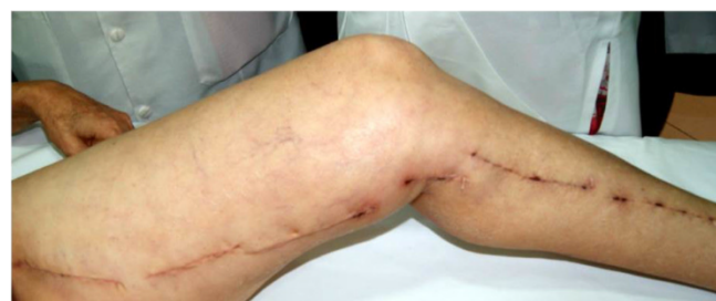
Fig. 5 – Absence of infection in a patient with Vicryl Plus suture.