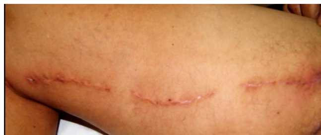
Fig. 4 – Absence of infection in a patient undergoing saphenectomy with Vicryl suture.