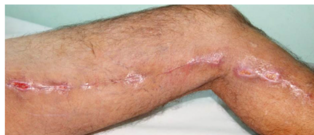
Fig. 3 – Photograph showing infection in a patient undergoing saphenectomy with Vicryl Plus suture.